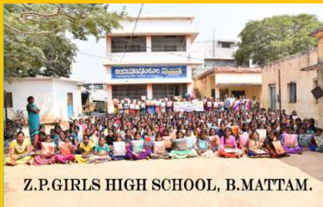
Z.P.GIRLS HIGH SCHOOL, B.MATTAM.