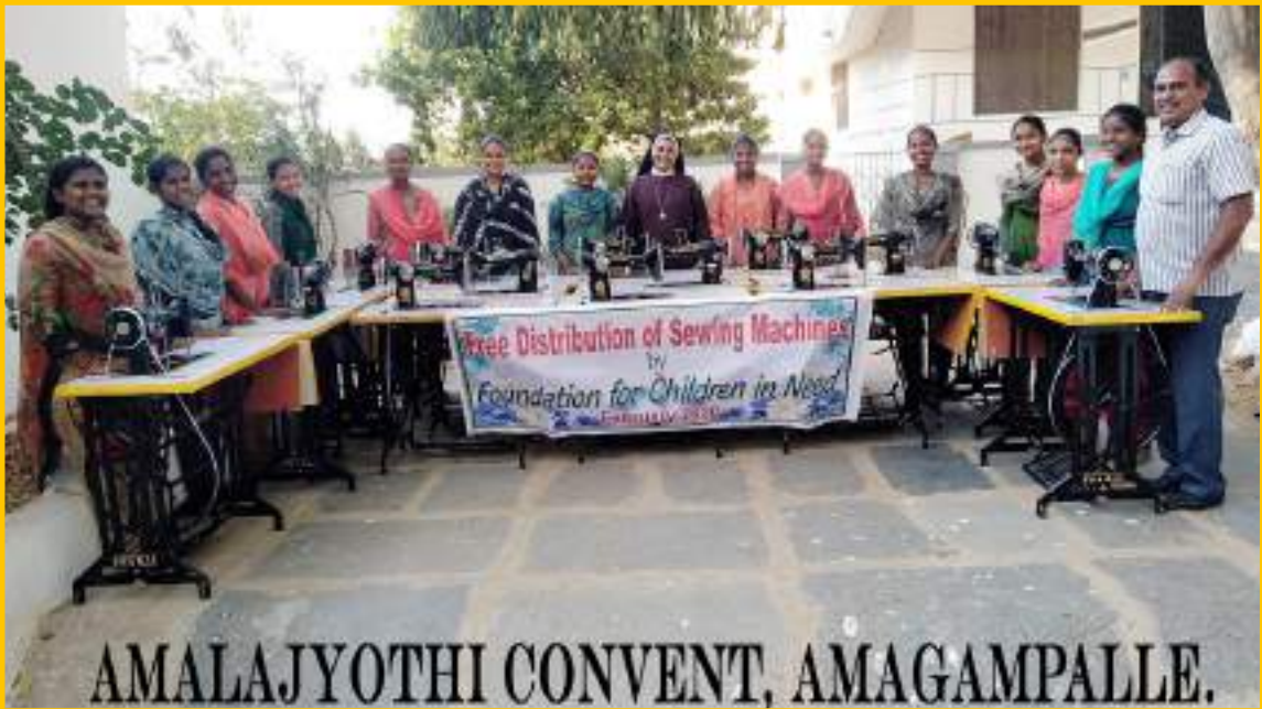
AMALAJYOTHI CONVENT, AMAGAMPALLE.