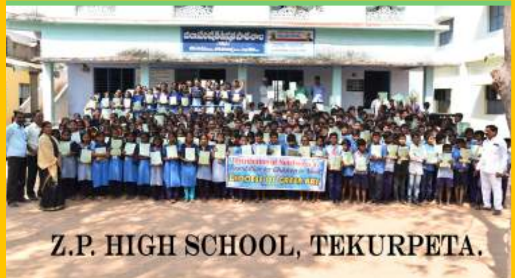
Z.P. HIGH SCHOOL, TEKURPETA.