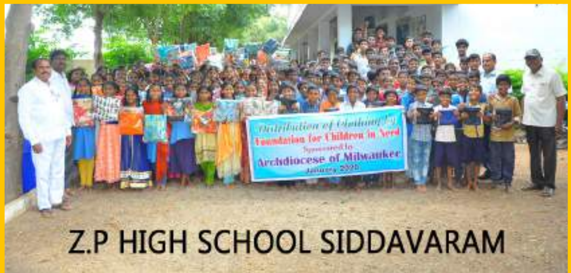
Z.P HIGH SCHOOL SIDDAVARAM

FCN Has helped 5350 children and adults with new clothing. They are delighted to receive them. The heads of the institutions are so happy by our efforts to serve the needy. All of them express their deep gratitude to FCN donors.