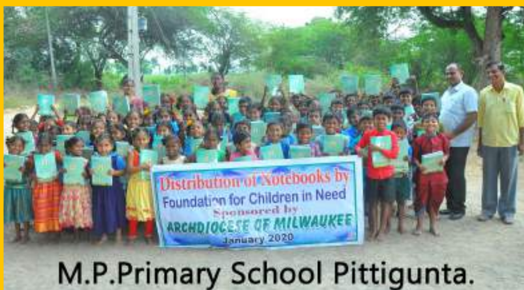
M.P.Primary School Pittigunta.