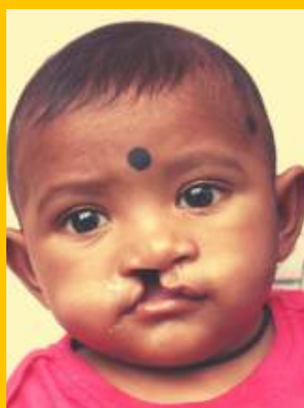
Lucky (Before & After)