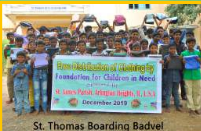
St. Thomas Boarding Badvel