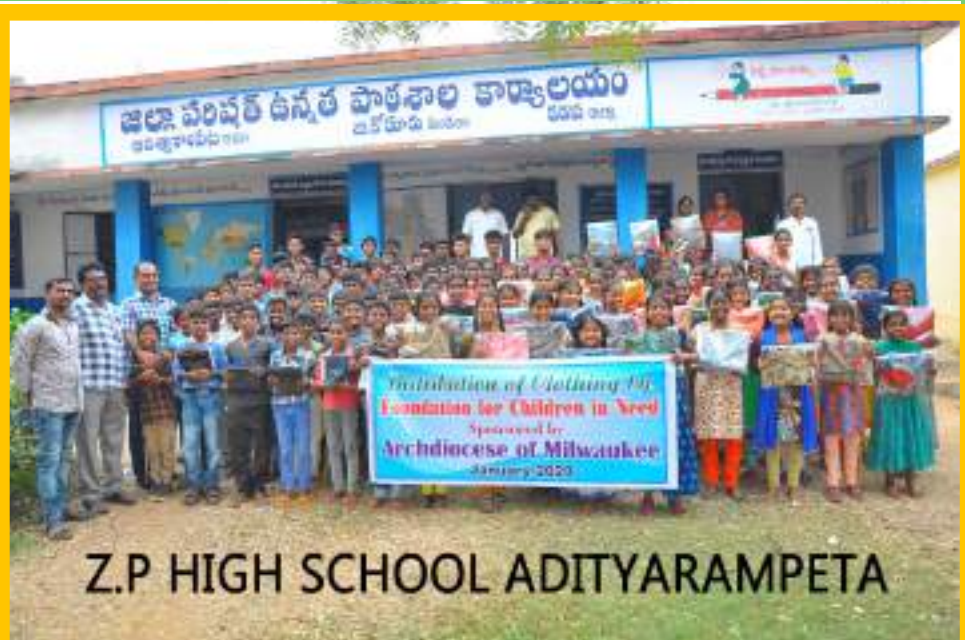
Z.P HIGH SCHOOL ADITYARAMPETA

FCN Has helped 5350 children and adults with new clothing. They are delighted to receive them. The heads of the institutions are so happy by our efforts to serve the needy. All of them express their deep gratitude to FCN donors.