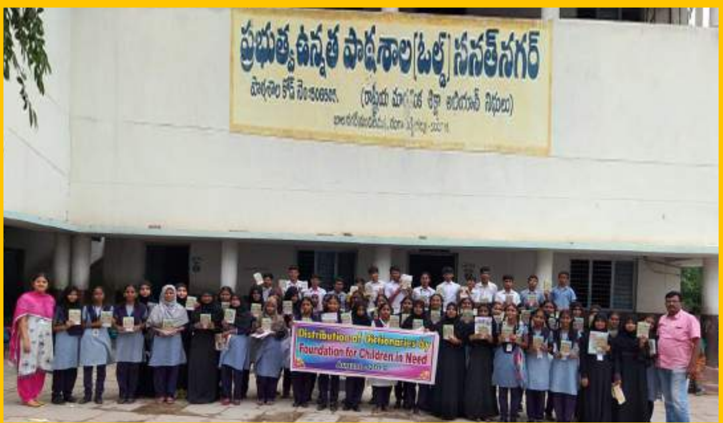
Distribution at Sanathnagar