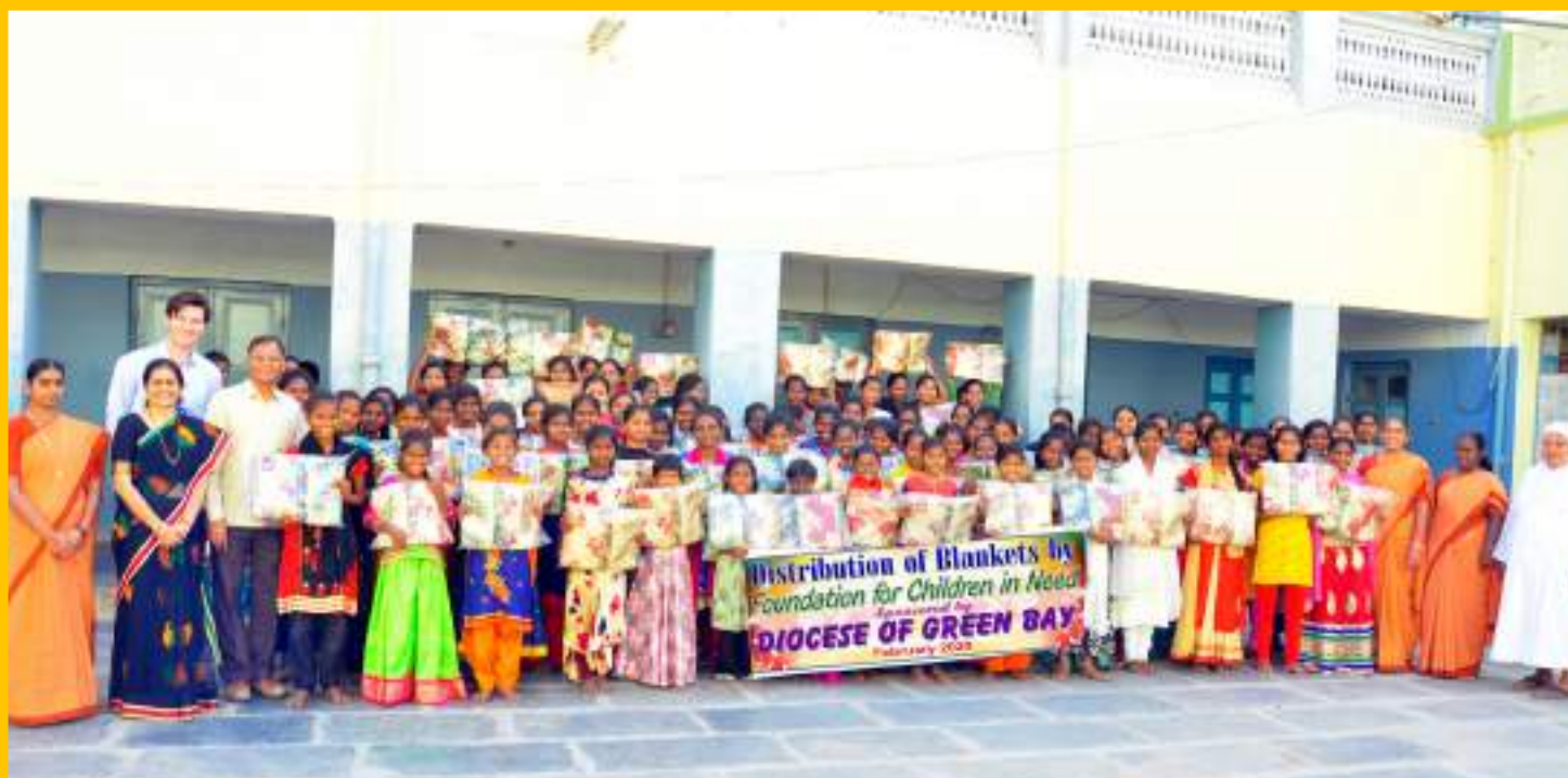
O.L.F Boarding, Porumamilla