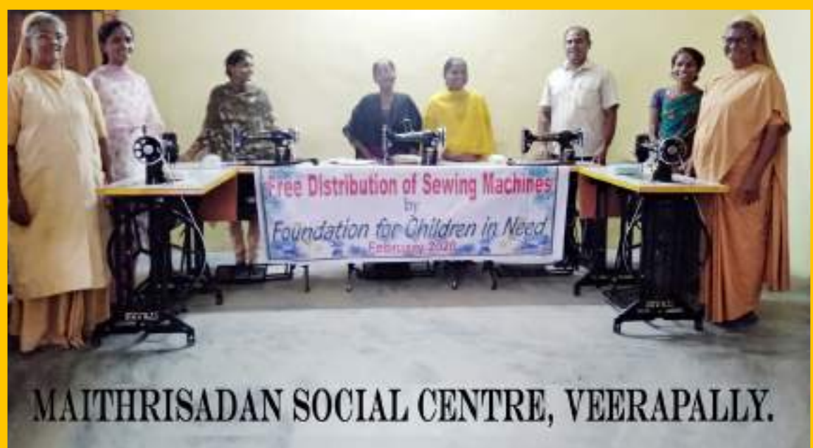
MAITHRISADAN SOCIAL CENTRE, VEERAPALLY.