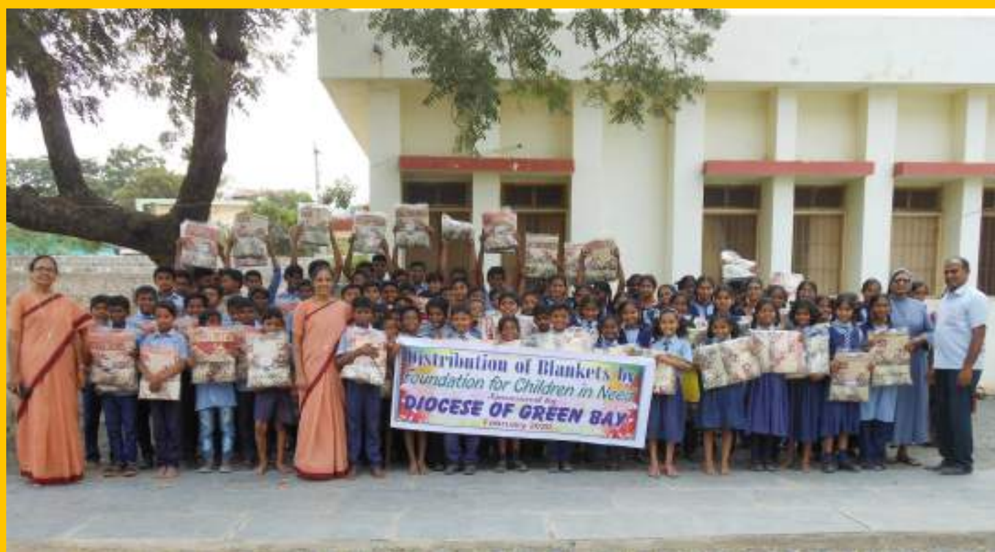
St. Ann's Hostel, Pulivendala