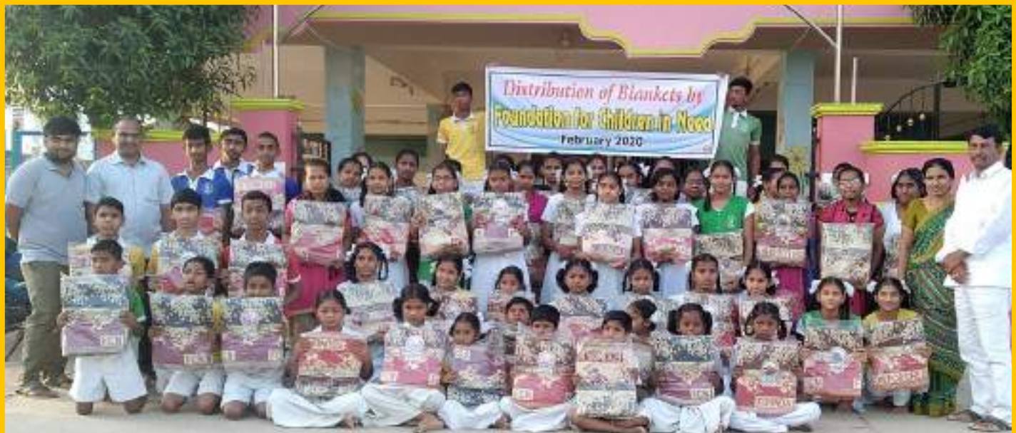
MOTHER THERESA HOME, PORUMAMILLA.

FCN is glad to distribute 1100 blankets to the needy persons. It certainly keeps them warm in the cold season.