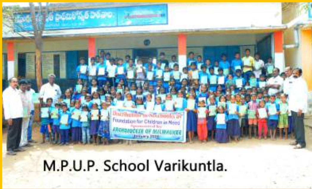
M.P.U.P. School Varikuntla.