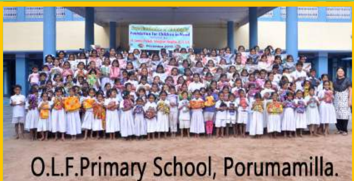
O.L.F.Primary School, Porumamilla.