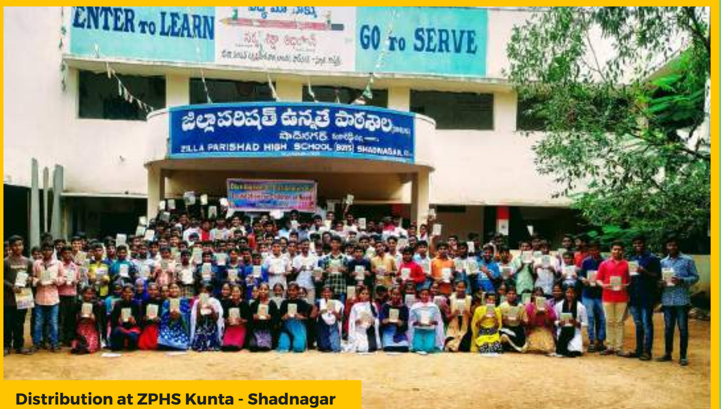
Distribution at ZPHS Kunta - Shadnagar