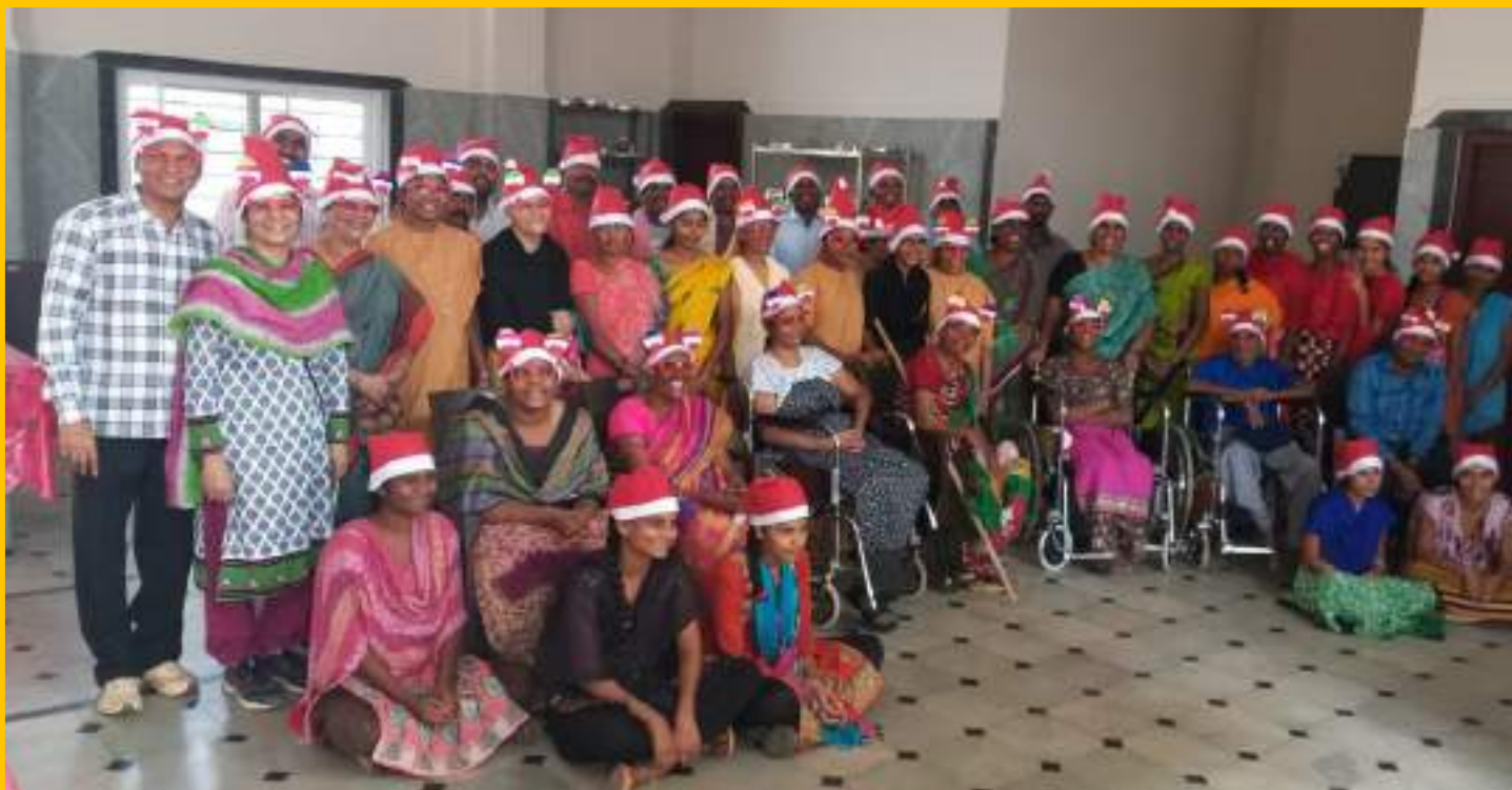
Christmas Celebration-December 2019