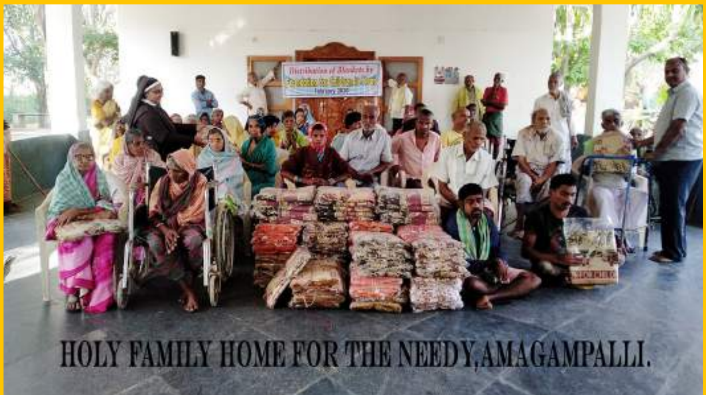
HOLY FAMILY HOME FOR THE NEEDY, AMAGAMPALLI.

FCN is glad to distribute 1100 blankets to the needy persons. It certainly keeps them warm in the cold season.