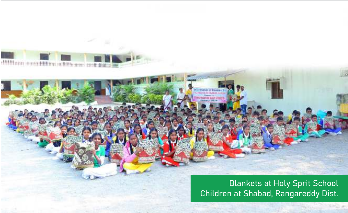
Blankets at Holy Sprit School Children at Shabad, Rangareddy Dist.