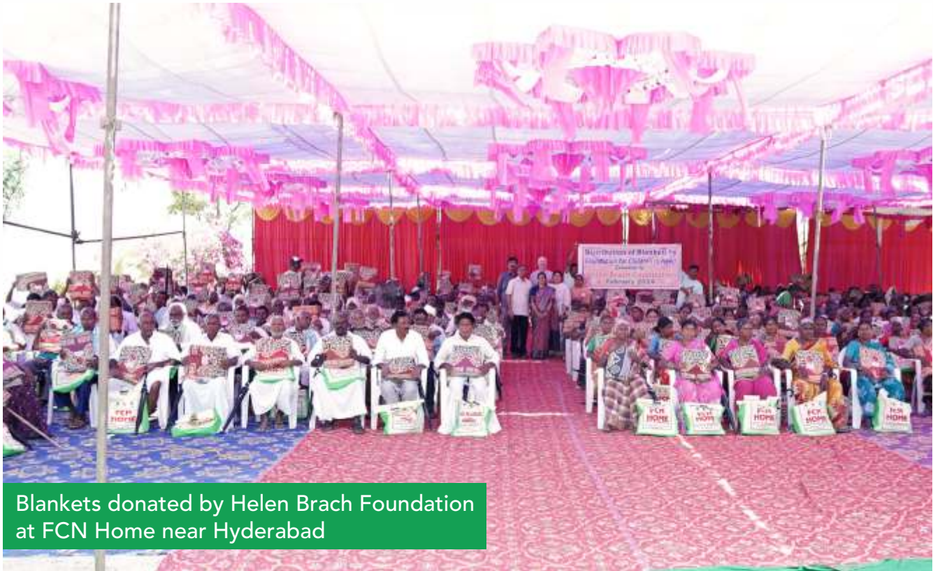
Blankets donated by Helen Brach Foundation at FCN Home near Hyderabad