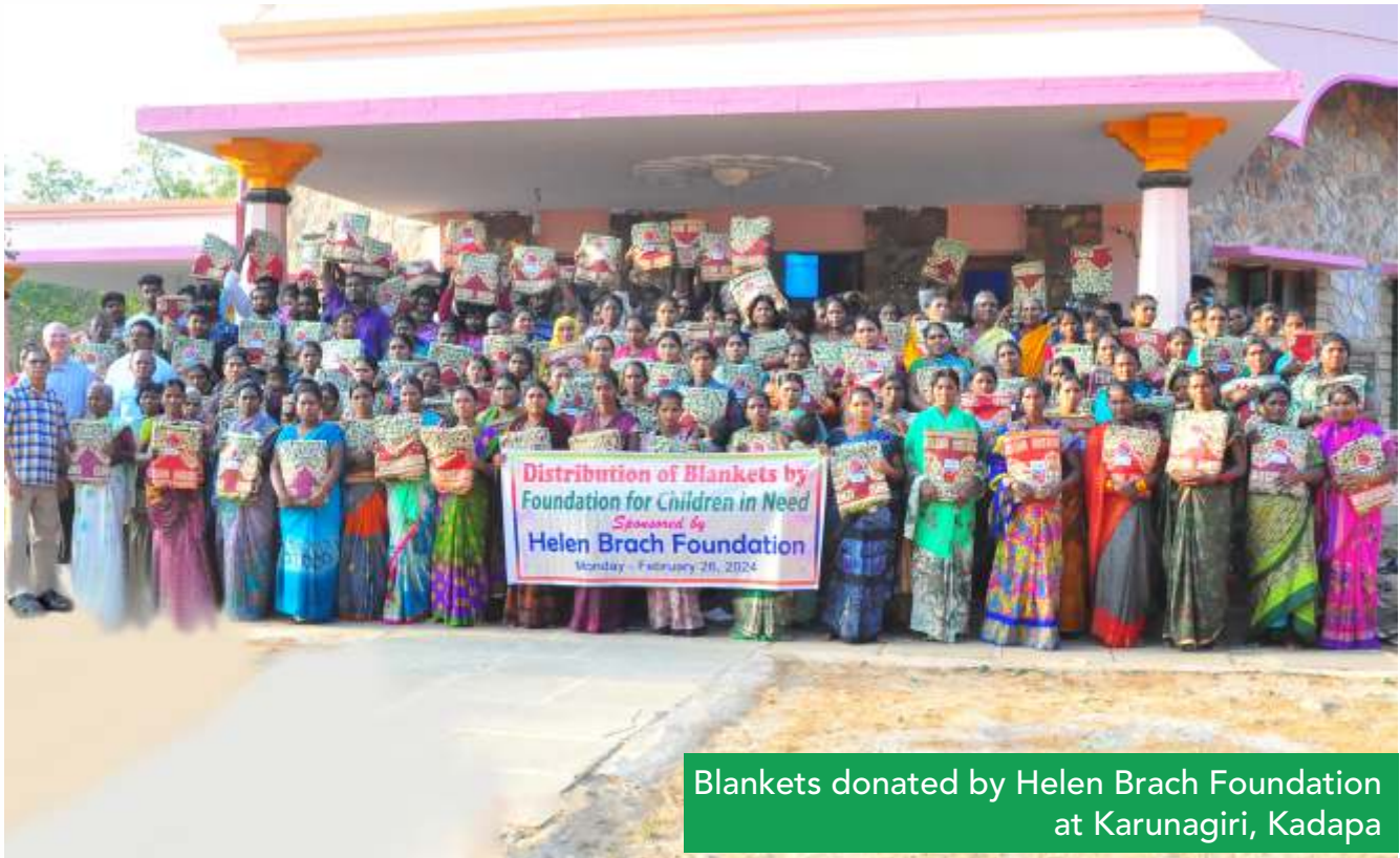
Blankets donated by Helen Brach Foundation at Karunagiri, Kadapa