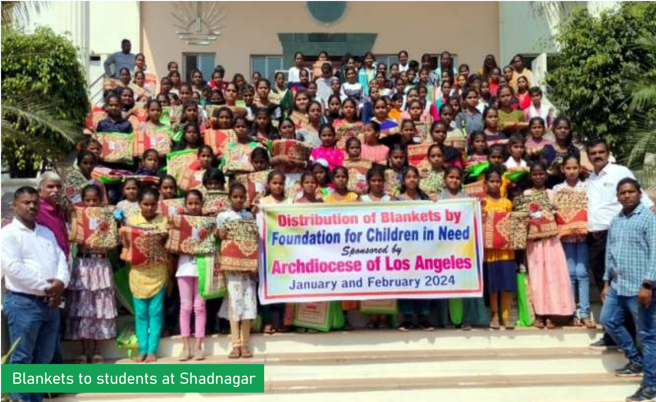
Blankets to students at Shadnagar