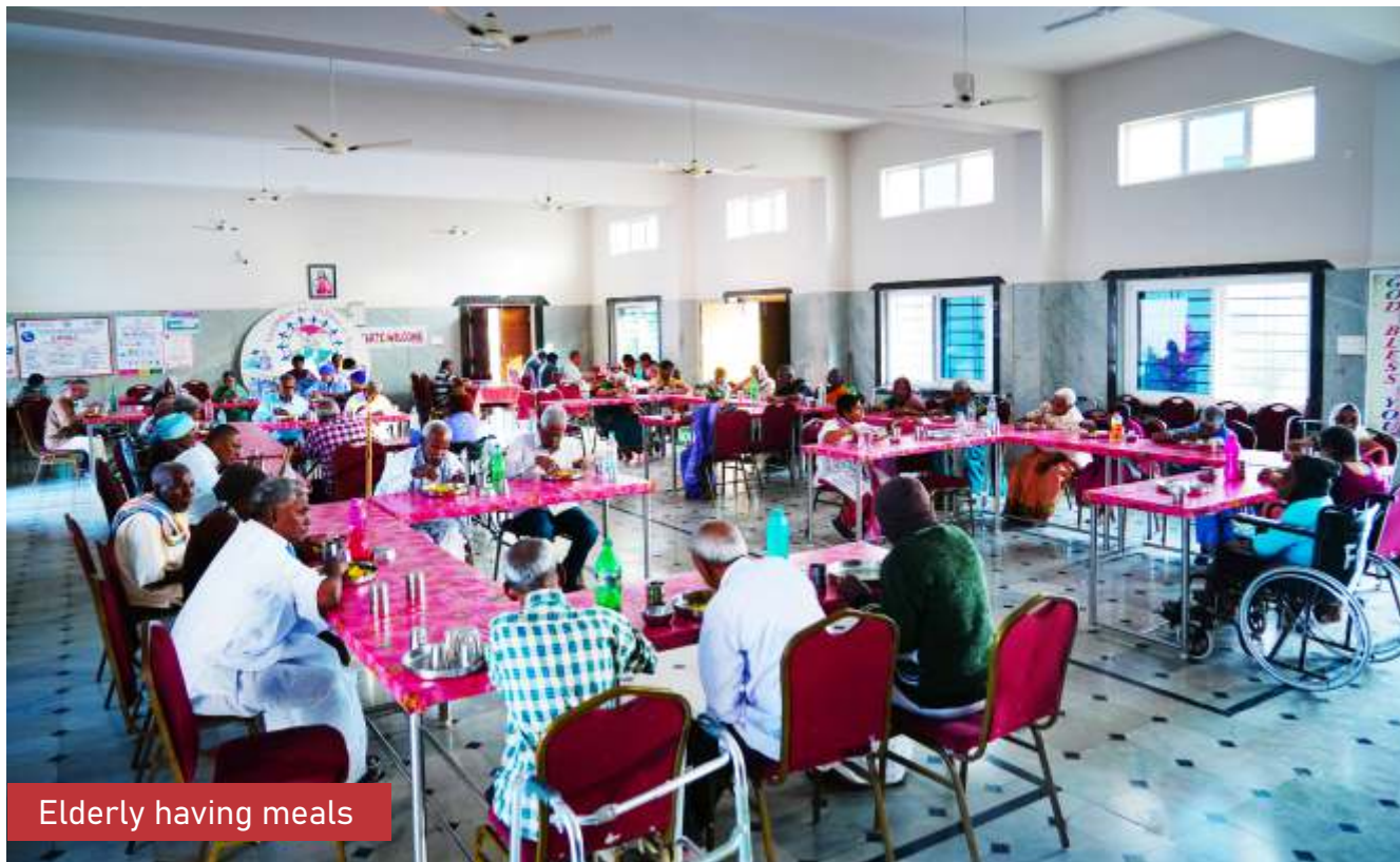
Elderly having meals