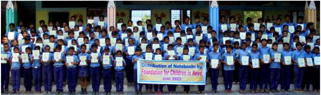
St. Antony's School, Kalasapadu