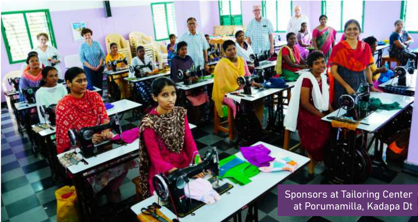
Sponsors at Tailoring Center at Porumamilla, Kadapa Dt