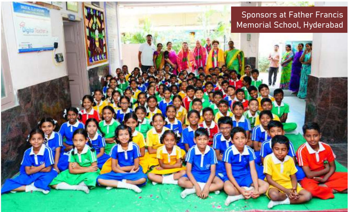
Sponsors at Father Francis Memorial School, Hyderabad