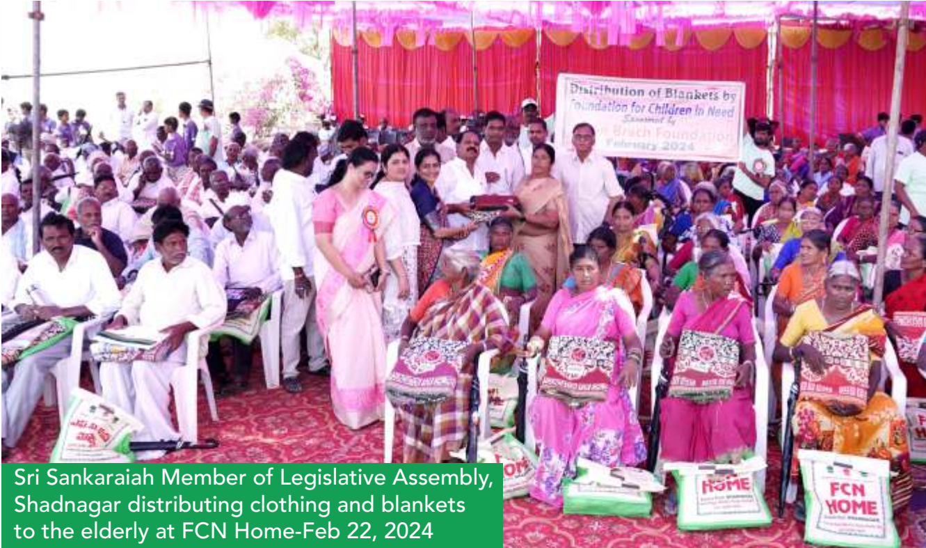
Sri Sankaraiah Member of Legislative Assembly, Shadnagar distributing clothing and blankets to the elderly at FCN Home-Feb 22, 2024