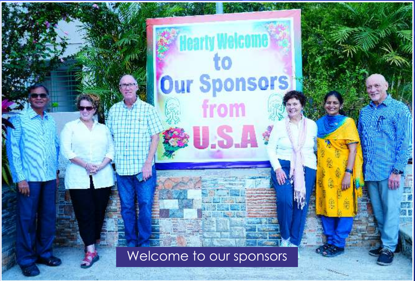
Welcome to our sponsors