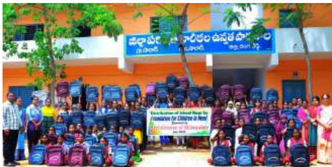
Z.P. High School, Shabad