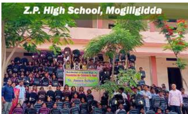
Z.P. High School, Mogilligadda