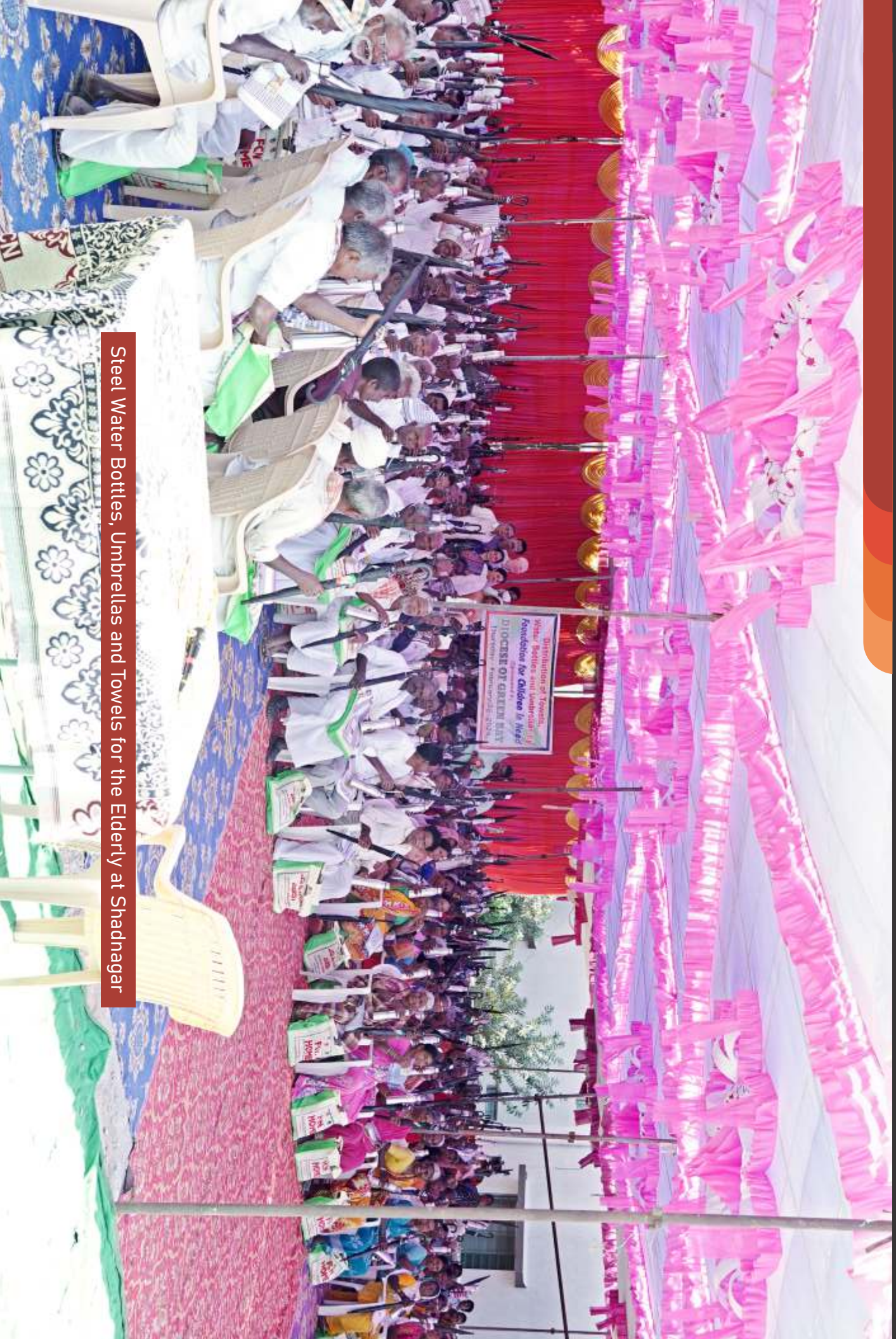
Steel Water Bottles, Umbrellas and Towels for the Elderly at Shadnagar