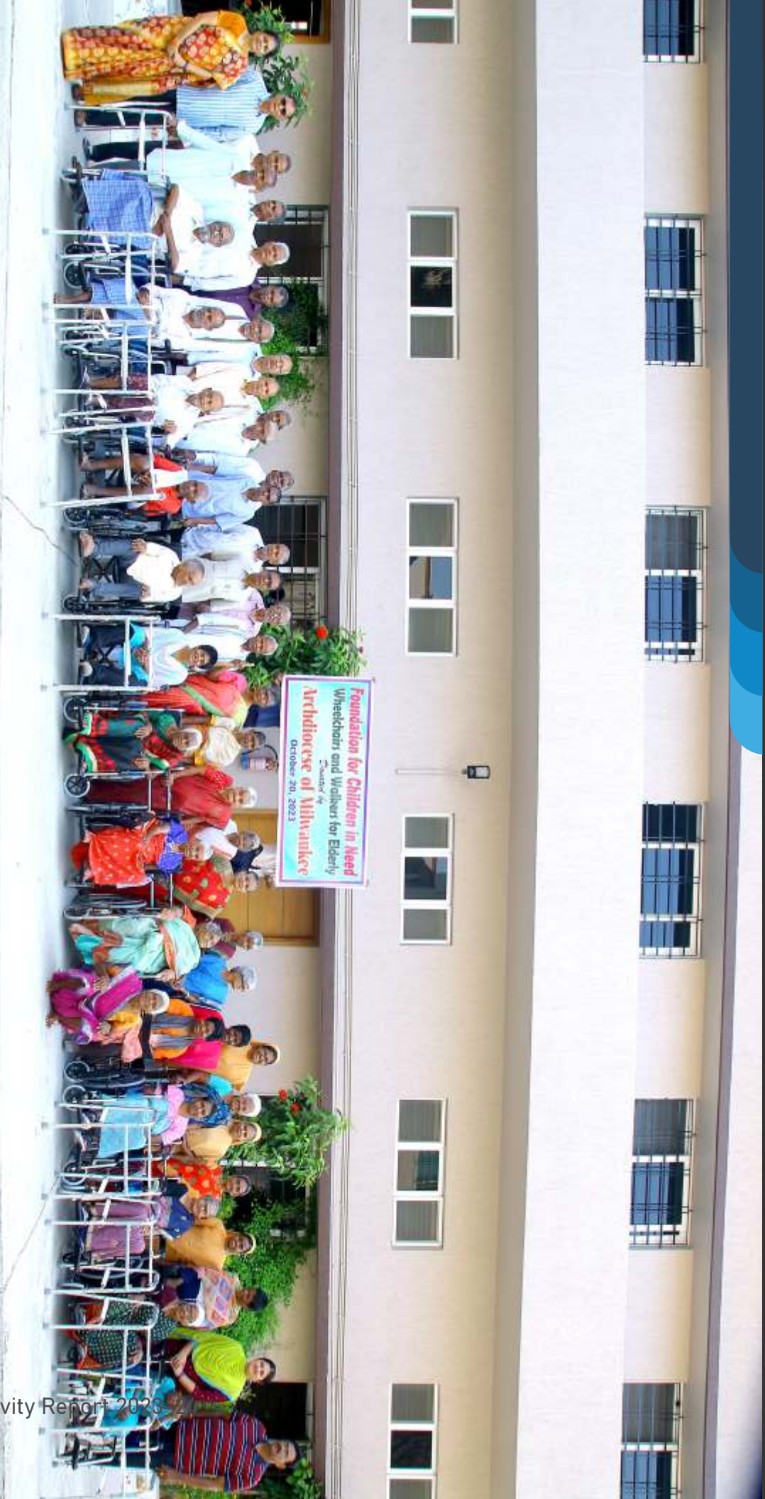
Wheelchairs and Walkers for elderly at FCN Home donated by Archdiocese of Milwaukee