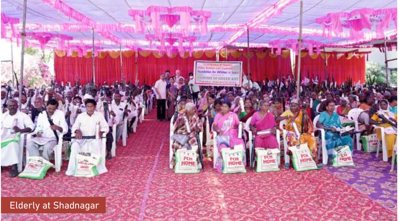
Elderly at Shadnagar

Through the generosity of the Diocese of Green Bay, WI we were able to distribute 500 elderly with steel water bottles, umbrellas and towels.