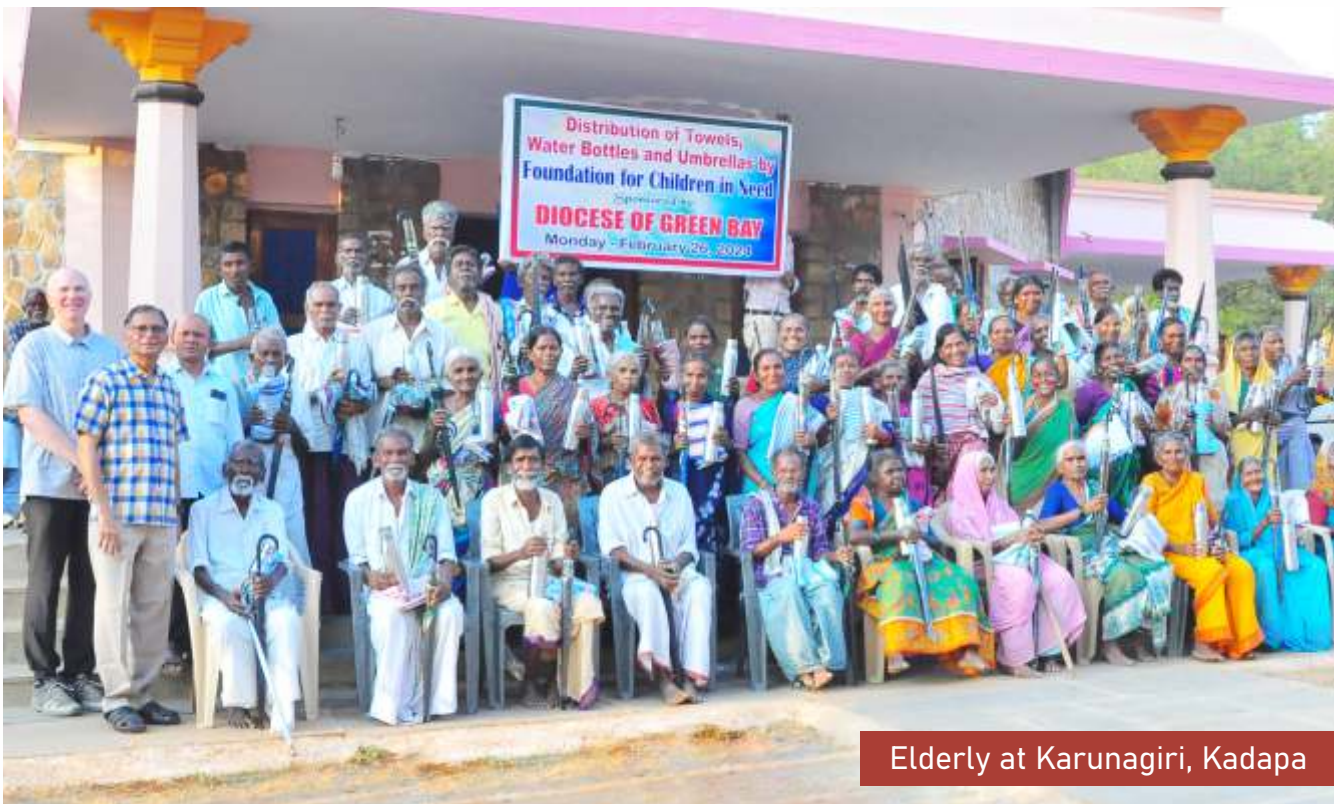
Elderly at Karunagiri, Kadapa