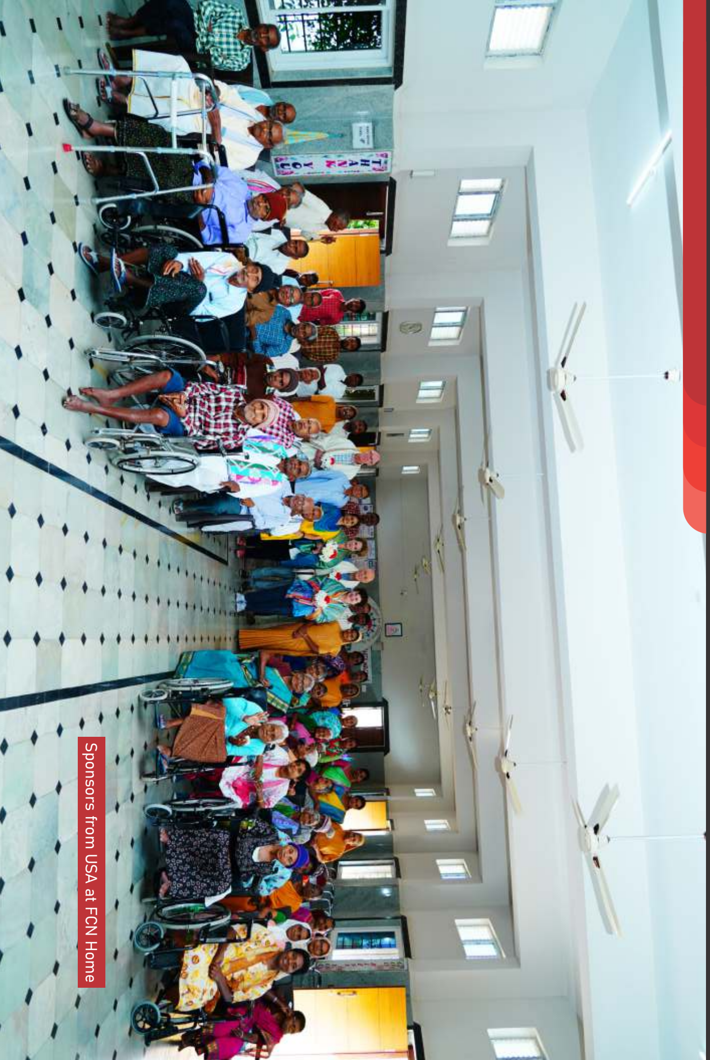
Sponsors from USA at FCN Home