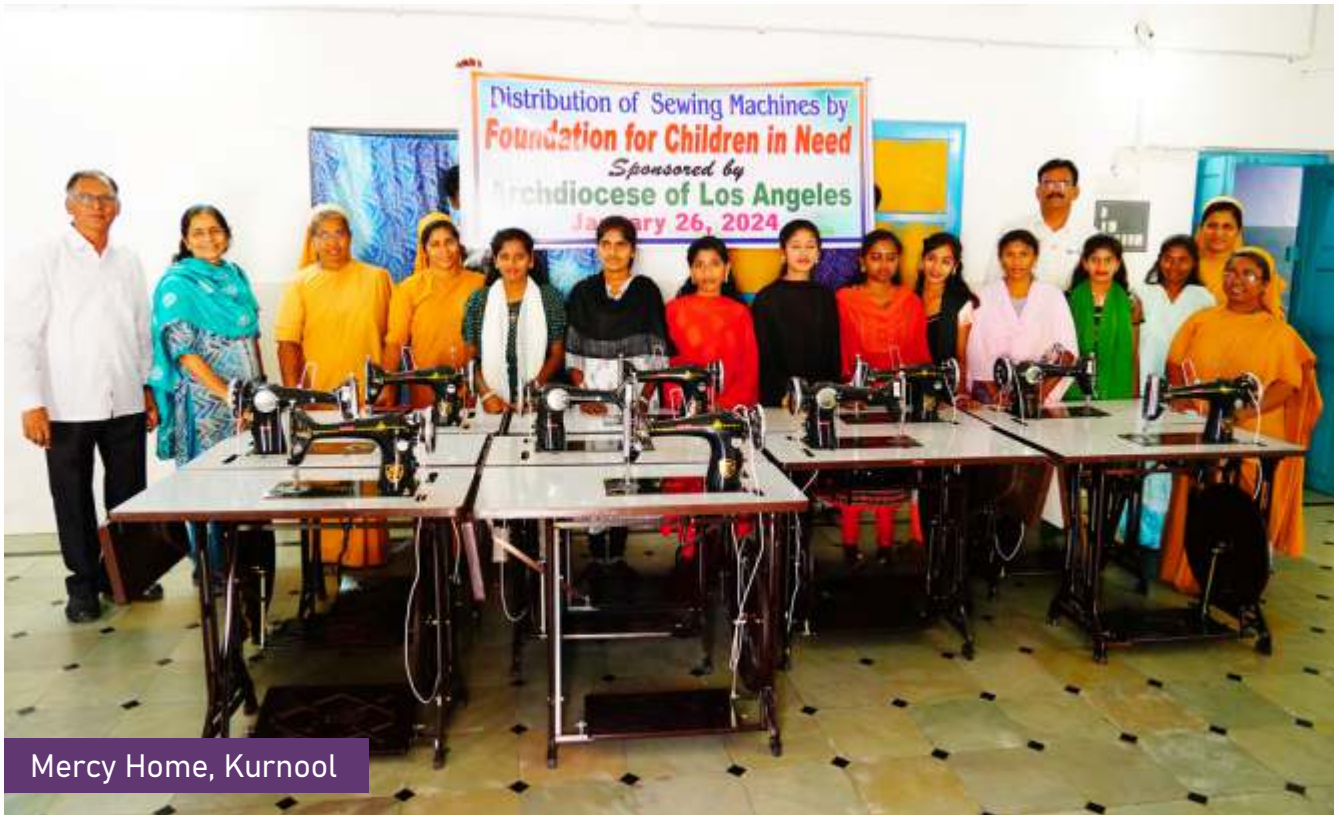
Mercy Home, Kurnool